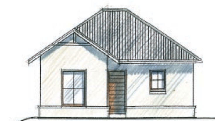
FRONT ELEVATION A3 1:100