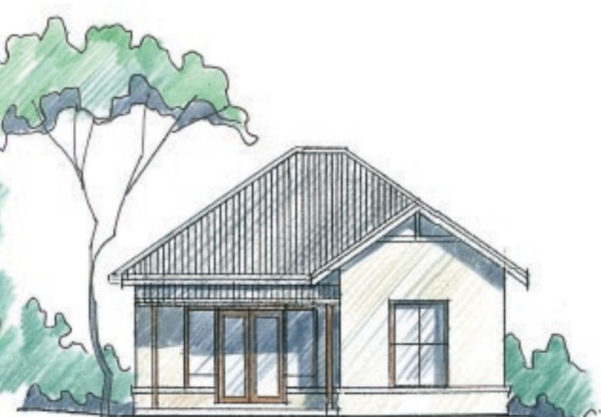
GARDEN ELEVATION A3 1:100