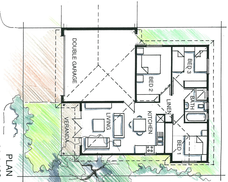
PLAN A3 1:100