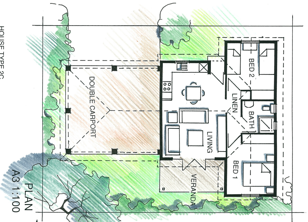
PLAN A3 1:100